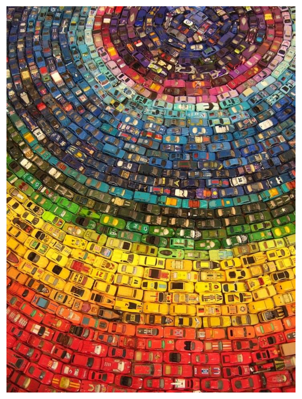
The children will be learning to mix primary colours to make secondary colours and to apply different colours to paper, maintaining their separateness.