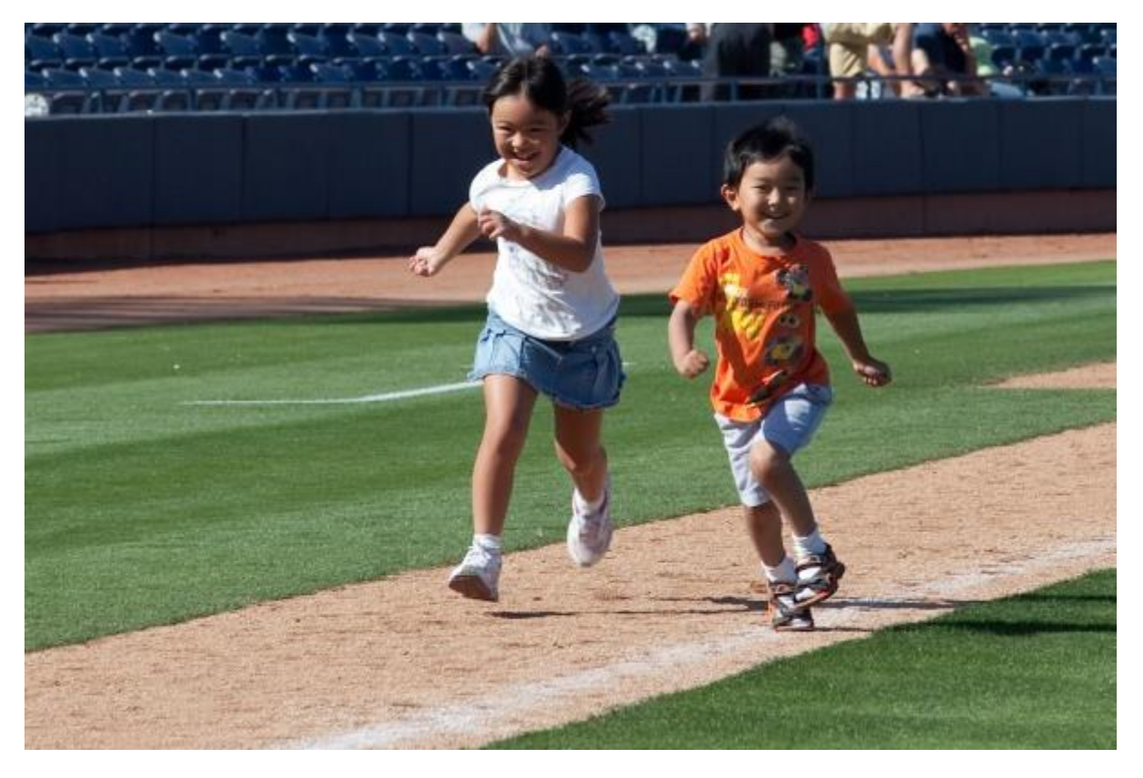
The children will continue to learn a variety of team games to develop spatial aware ness, moving in different ways and along different pathways, dodging and changing direction.