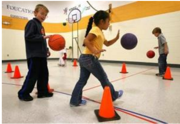
6 - PE

We will be making our own dinosaur fossils! We will choose different dinosaurs to press into salt dough and then when they are dry we will hide them in the sand for our friends to dig up.