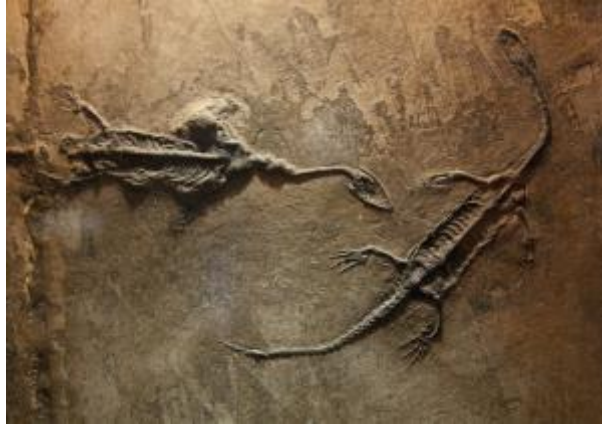
5 - Playdough

We will be making our own dinosaur fossils! We will choose different dinosaurs to press into salt dough and then when they are dry we will hide them in the sand for our friends to dig up.