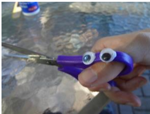
4 - Fine motor.

Over this half term we will be examining the work of Roy Lichtenstein . We will be creating our own piece in his artistic style.