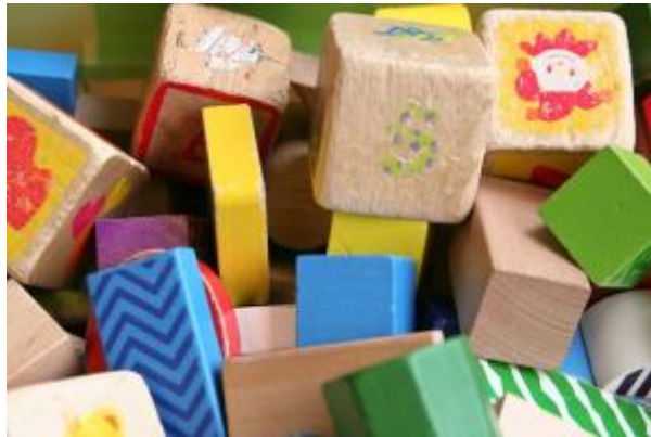
2 - Construction

We will be measuring different dinosaur footprints using cubes and we will be ordering the footprints from smallest to largest.