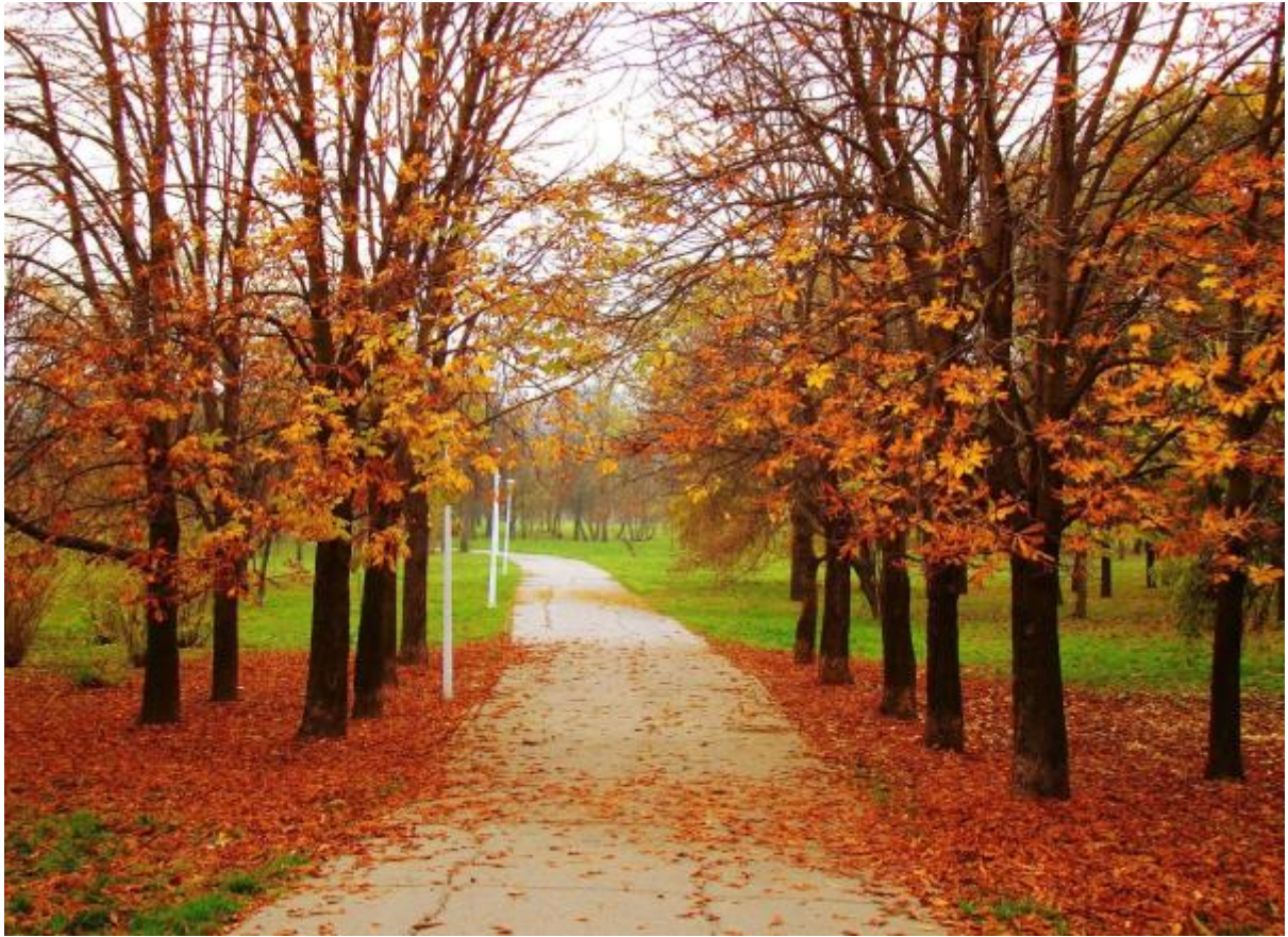
Team 3 Autumn 2.